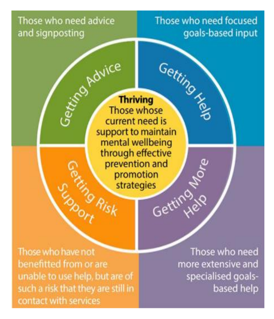
Figure 1: The i-THRIVE framework